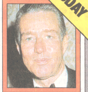
HALSTON: Died of AIDS complications, 1D

HATS OFF TO HALSTON; FRIENDS, FASHION WORLD MOURN DEATH 1D